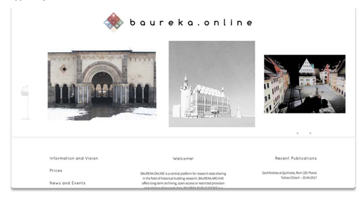
Fig. 4: Welcome page of baureka 's interactive mock-up.

Overall, the development of the research data infrastructure baureka.online aims to improve the cooperation within the specialist community of historical building research and building archaeology in the German-speaking area and to create synergies between science and practice. Currently, there is no digital platform for the valorisation and overarching analysis of existing scientific documentations. The paper tried to explain the approach of baureka.online as a specific, user-oriented repository and research tool for the community that is being developed through a participatory design process. Following this path, the authors hope to be able to establish this urgently needed and desired piece of central digital infrastructure, which will make it possible to further propel the research methodology of building archaeology into the digital age and to efficiently position the discipline in an international context.