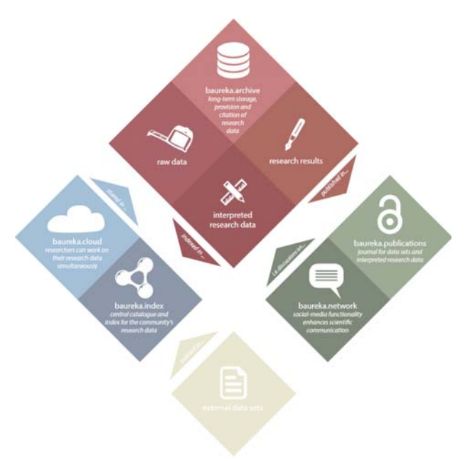
Fig. 2: Internal structure of baureka.online

Further talks with the research community were then undertaken in a day-long workshop in March 2017 (Fig. 1). On this occasion, together with approximately 40 participants the authors were able to verify the feasibility of the project, identify its possible pitfalls and collect additional opinions on the direction it would have to take. In addition, a steering committee was created which as soon as the authors' funding requests prove successful, will meet about once every six months to accompany and evaluate the development of the project. During the discussions it became clear that in addition to the original use cases, i.e. archiving, exchanging and publishing research data, there was also a rising demand for further tools aimed at improving communication within the discipline and at structuring collaborative workflows. At the same time, however, the participants reached the conclusion that in order to establish the platform as a central contact point for retrieving building research data it was essential to arrive at an