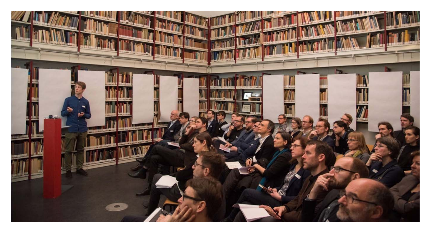
Fig. 1: Baureka's initial workshop in Aachen, March 2017 (Foto: Tim Scheuer).

tackle new, comparative research questions. And finally, they would create a completely new basis for cooperation and exchange within and beyond the community, for example by tapping into synergergies between research, conservation and planning. Baureka.online has thus been conceived as a comprehensive web-based platform that will become a crucial prerequisite of a new culture of data exchange and publishing within the discipline and community of building archaeology.